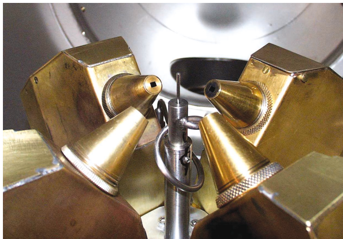
FIG. 1. Closeup view of the entrance nozzles of the four PPAs and the effusive gas jet.

The apparatus consists of a vacuum chamber with four parallel-plate electron analyzers (PPAs) mounted 90° from each other on a computer-controlled turntable. The sample gas is let into the chamber by an effusive jet. The x-ray beam intersects the sample gas close to the nozzle of the jet. The four PPAs are aligned such that they view the interaction region at the "magic" angle of 54.7° with respect to the vertical. A detail of the spectrometer nozzles and the effusive jet is shown in Fig. 1. For the measurement of the nondipolar asymmetry, the analyzers are positioned along the