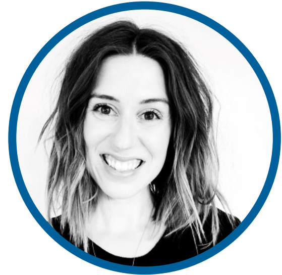
COLLEEN BORDEAUX Best-selling author and entrepreneur

Tomorrow you'll learn why high achievers with scores of obligations and worries often find it particularly challenging to manage their mental state and what can be done about it.